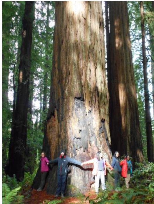
Top left: Fellows gathered around one of the massive Redwoods in Stout Grove.

maintaining healthy redwood forests. They manage to achieve future old-growth conditions throughout the park. Some might be surprised to know too that Douglas fir and Sitka spruce grow side by side these tall trees. A good reminder to not forget to see the forest for the trees the next time you visit!