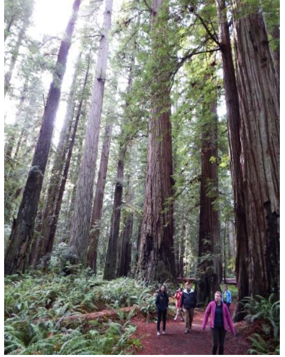
Top right: A walk amongst the giants is a once-in-a-lifetime opportunity for some of these Fellows