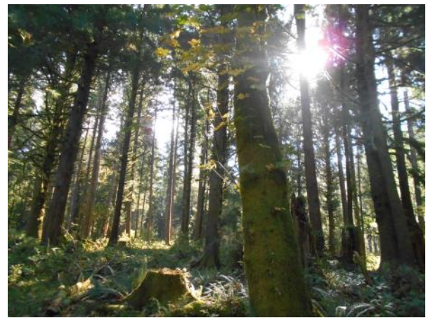
A 2006 thinning, underplanted with spruce with a lot of natural regeneration from both hemlock and spruce. The bigleaf maple was left to help promote biodiversity in the stand.