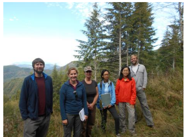
Standing at the top of a thinned stand, WFI Fellows and EFM staff were able to look beyond EFM property, across various ownerships with a view to the ocean.