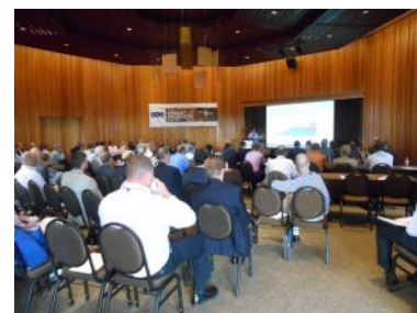
The Forest Products Forum had a great turnout of folks interested in industry updates.

Who Will Own the Forest? 11 will be held September 15-17, 2015 and will be immediately preceding by the Forest Products Forum on September 15, 2015.