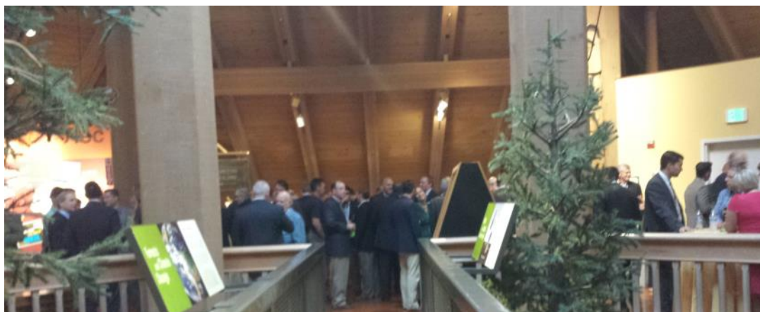
The top floor of the Discovery Museum during the opening reception of WWOTF10.